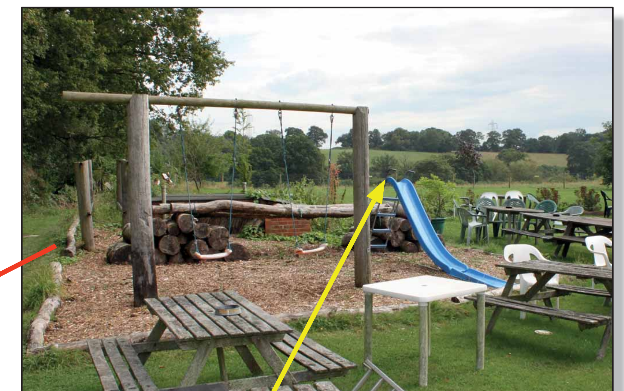
View from garden to the site boundary line