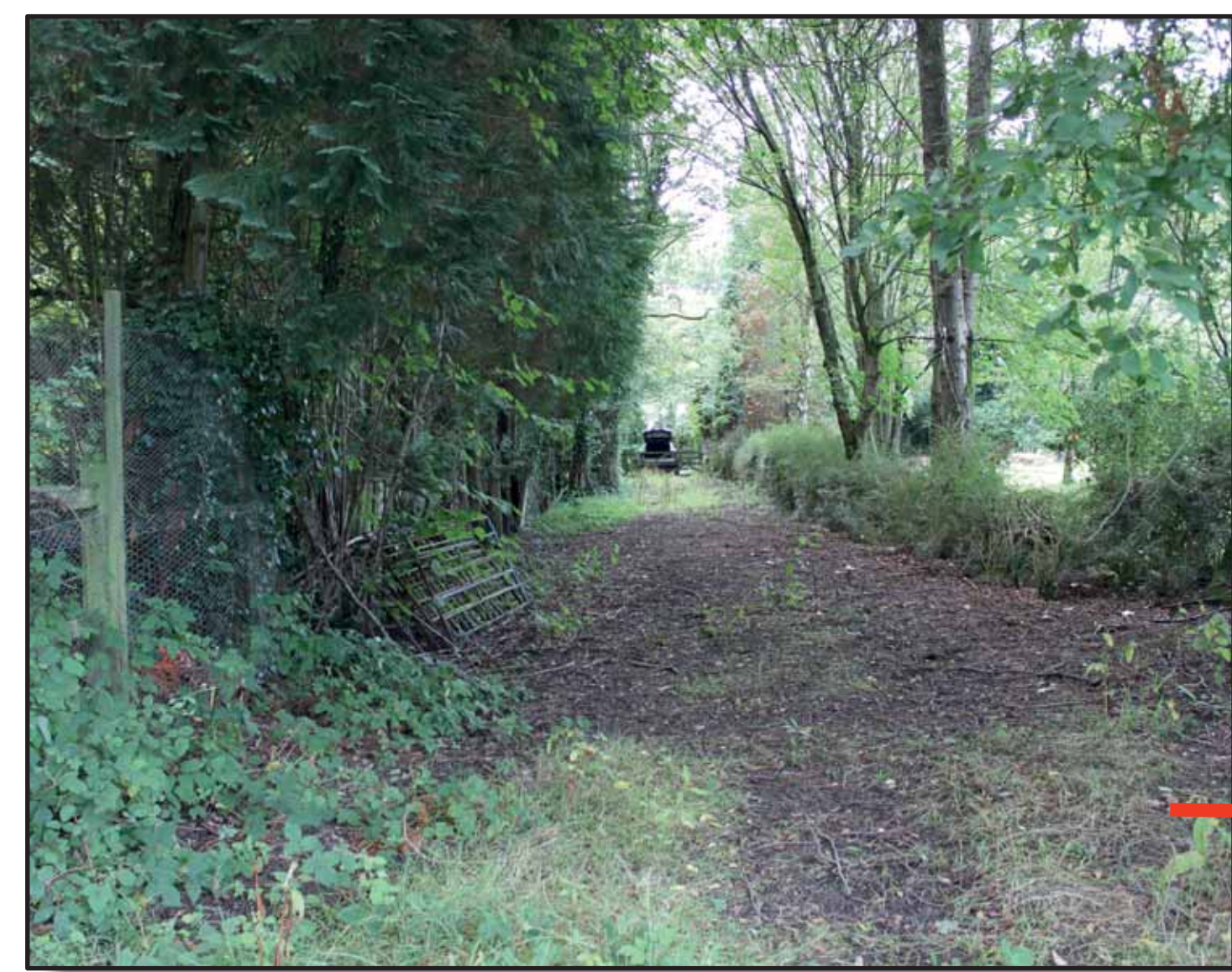
Above shows drive to Nuthurst Road from the site