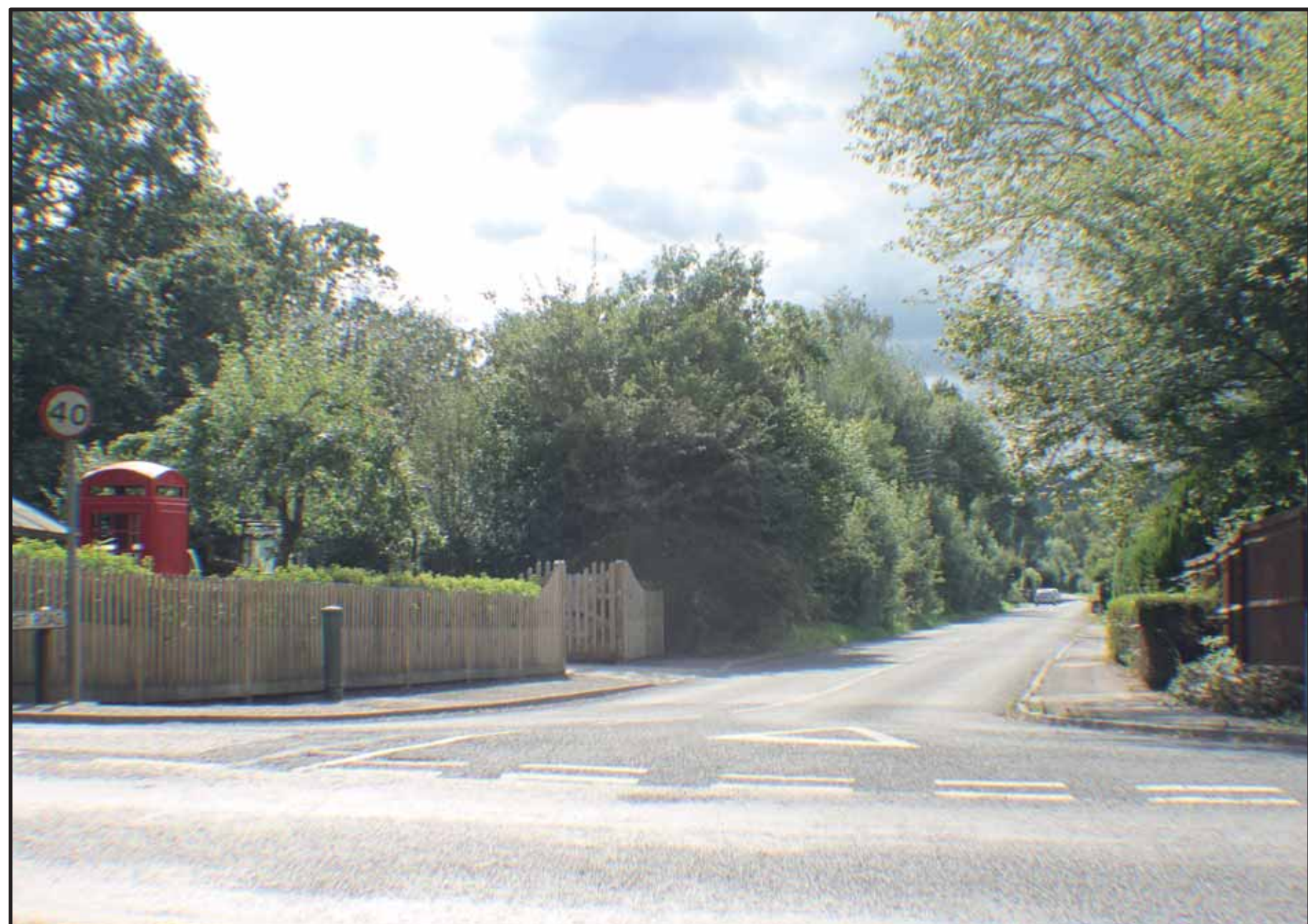
View from A281 looking down Nuthurst Road